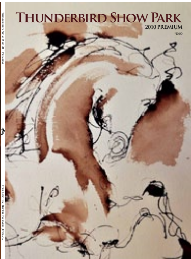
2010 Premium front cover