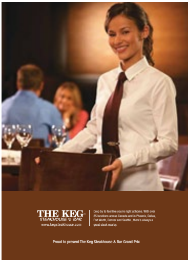
2010 Premium back cover